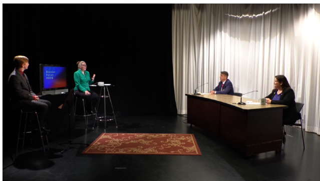
Waycross Election Forum: State Representative, 28th District

Waycross produced 245 new government access programs, totaling 226 hours. In addition to meetings, programs included Columbus Report, Election Forums, Talking with...., County Fare, Concert on the Commons, Forest Park Chamber of Commerce Meetings, special Covid-19 Programming, Special Library Programming, Special FP Senior Center Programming, FP City Manager video podcasts, and many more.