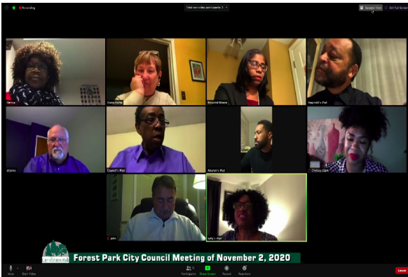
Forest Park City Council Meeting

The Waycross Government Access Channel is operated on behalf of the governments of Forest Park, Greenhills, Springfield Township and Colerain Township. Our mission - To encourage the active participation of residents in the democratic process - is achieved through the effective use of communication tools, providing our governmental bodies with the necessary resources to educate and inform residents on the various activities and issues – local, state and federal - that ultimately impact their quality of life.