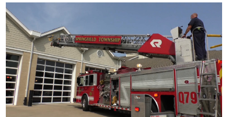
Springfield Township Virtual Touch-A-Truck