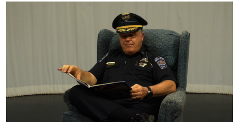
Storytime with the Greenhills Police Chief