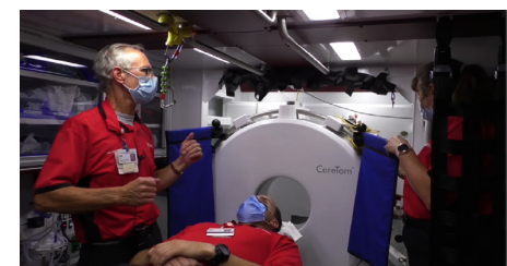
Talking with Forest Park - Mobile Stroke Unit