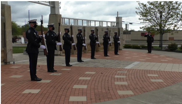
Colerain Township Memorial Day Ceremony

Waycross cablecasts & streams the council and trustees meetings from our four communities LIVE, then replays them throughout the month. Waycross cablecast all general council/trustee meetings held in 2020 for our communities. In addition, Waycross videotaped for playback* public hearings and zoning meetings, Winton Woods and Northwest School Board meetings, as well as the Hamilton County Public Library Board of Trustees meetings. *NOTE: ALL meetings after April 1 were cablecast and streamed LIVE, including many boards and commissions not normally cablecast, due to Covid 19 requirements.